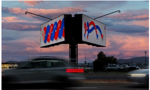
Source: MOVE, Canberra Airport LF Assets, 1 Week, 100% SoT, VAC Impressions Source: MOVE March 2026, QMS, 28/7/25-3/8/25, Canberra Digital Large Format Sites, National Audience, P14+, 100% SOT, ROTs

Our Canberra Airport assets capture high-value interstate audiences.