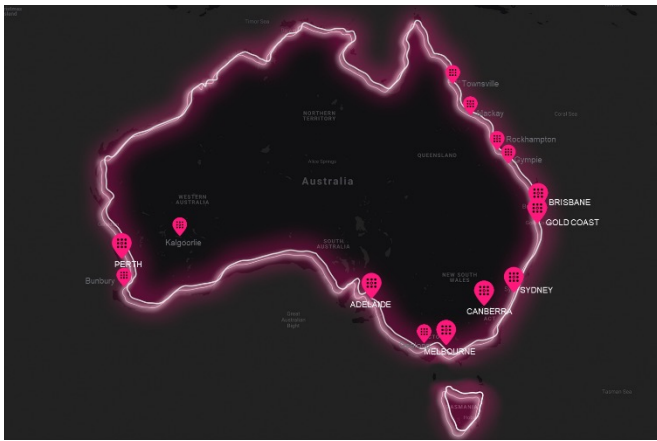
Source: MOVE March 2026, QMS, 28/7/25-24/8/25, All QMS Large Format, 5 Metro Markets, P14+, 100% SOT, ROTs

Over the last 3 years, the QMS Digital Large Format network has expanded by 20% .